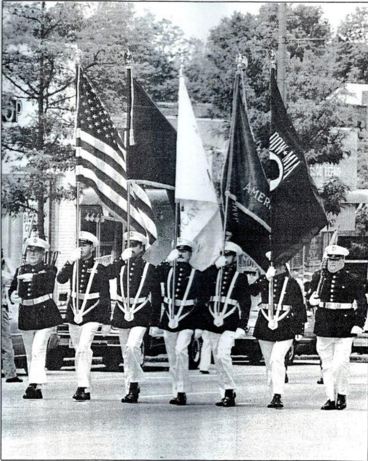
The Color Guard Unit of the American Legion's James E. Coffee Post of Nashua marches down Main Street in Nashua on Sunday during the American Legion's 73rd annual state convention. The unit placed first for the second year in a row in the color guard competition.